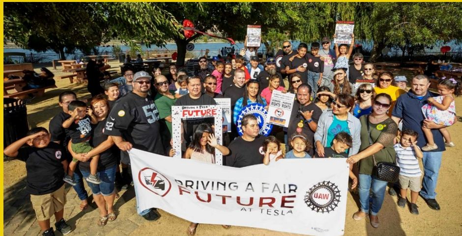
Tesla workers in Fremont, CA rally for safe working conditions and workplace rights

Tesla Motors, led by high-profile CEO Elon Musk, is a leading U.S. manufacturer of electric vehicles, with an auto assembly plant at an auto assembly plant in Fremont, California. According to testimony from workers, research by National COSH affiliate Worksafe, and recent citations by Cal/OSHA, Tesla's clean cars are produced by workers who must endure dirty, unsafe working conditions.