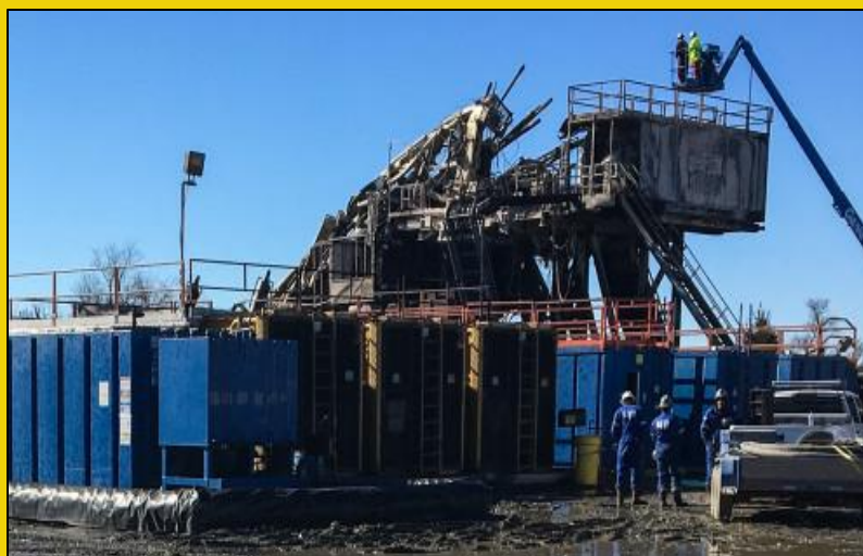
Inspections underway at site of gas well explosion in Quinton, Oklahoma, one of the worst onshore drilling disasters in U.S. history.

On January 21 of this year, five workers in Quinton, Oklahoma lost their lives after an explosion on a natural gas drilling platform operated by Patterson UTI. The Texas-based company has a long history of safety violations, including a death toll that now adds up to 13 workers in the last decade.